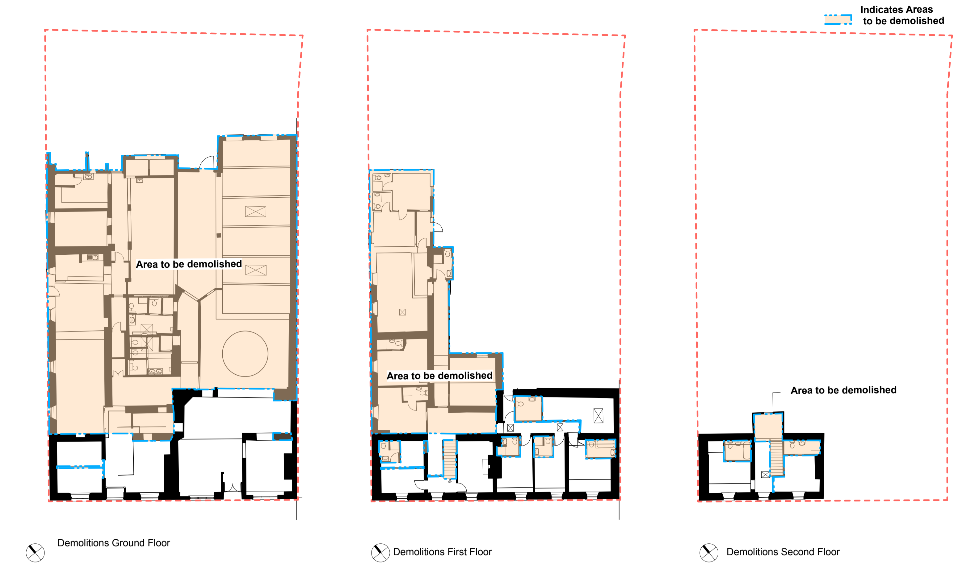
Demolitions Ground Floor