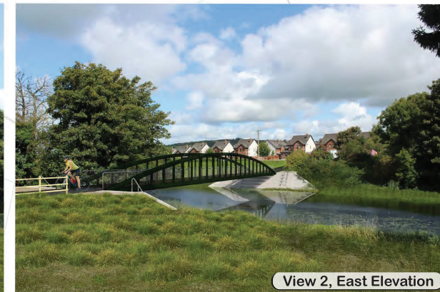
View 2, East Elevation