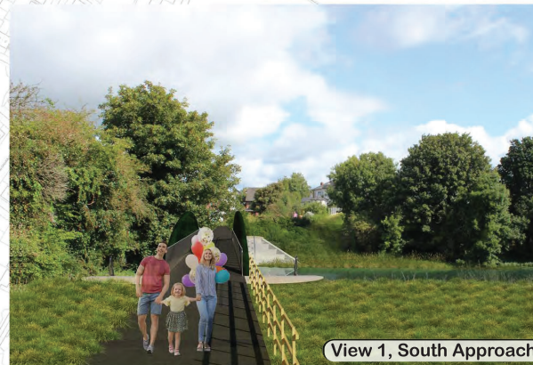
View 1, South Approach

The scheme proposes a new shared pedestrian and cycle path and access road commencing at Virginia Courthouse and extending northwards past the Virginia Handball Club. The road will provide access to the existing properties and the handball club including new parking bays. The scheme crosses the River Rampart via a single span arched truss bridge supported on seated abutments offset from the riverbank edge which maintains the existing riverbank public right of way. The scheme continues northwards where it will tie into Rampart View infrastructure.