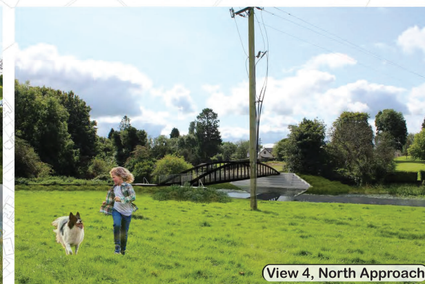
View 4, North Approach

As part of the scheme development, a Non-Statutory Public Consultation is now being carried out to allow members of the public an opportunity to review the current scheme and raise any comments.