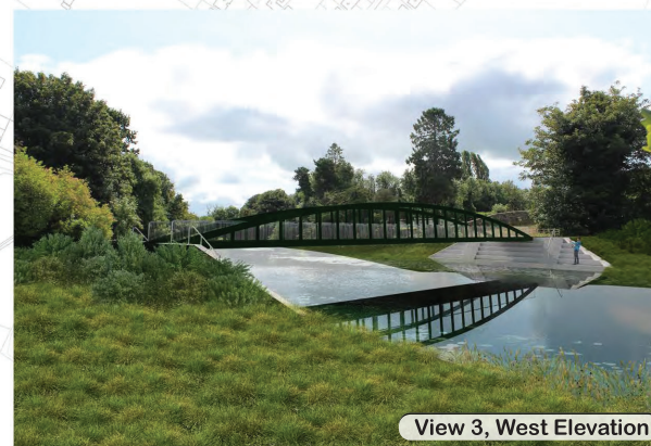
View 3, West Elevation