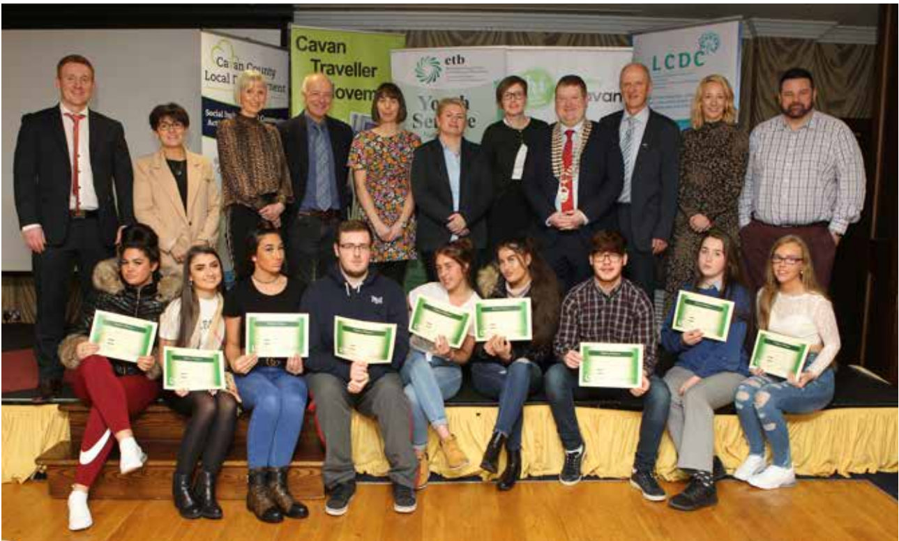
Launch of the Traveller Youth Needs Assessment in January 2020