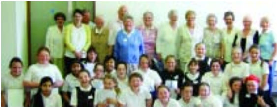
Bealtaine Festival Event 2009