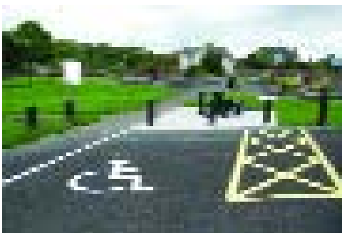
Belturbet Playground Accessible picnic table & parking