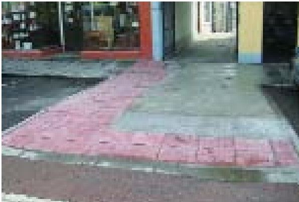
Tactile Paving at Pedestrian Crossing in Cootehill

Effective social inclusion results in each individual having an equal opportunity to make decisions that affect their quality of life. It ensures the fullest participation of all members of the community including minority groups such as Travellers, older people, disabled people, refugees, asylum seekers, economic migrants, gay/lesbian/bisexual people etc. in decision making processes. By agencies (such as local authorities, health boards etc.) promoting and actively pursuing social inclusion policies, all people within a community can be supported and encouraged to participate in the life of their community.