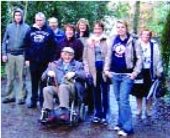
Participants of the Cross Border Project - County Museum