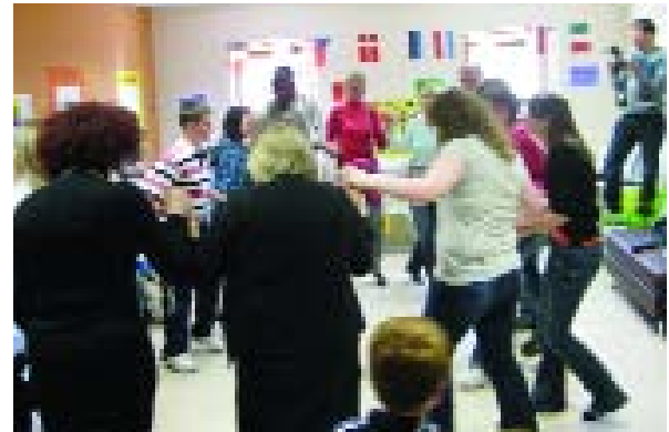
Comhairle na nÓg Multi-Cultural Event 2009