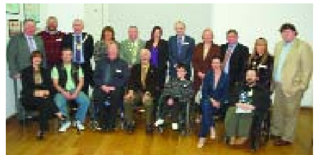
Launch of Cavan County Council Disability Strategy 2009