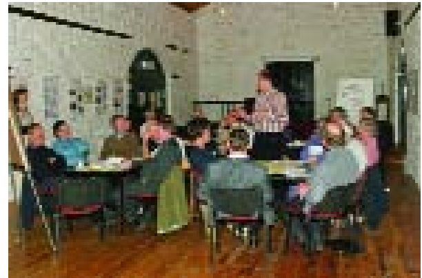
Public Consultations for the County Development Plan