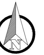
Location Map OS Sheet No. 1411-B Scale NTA